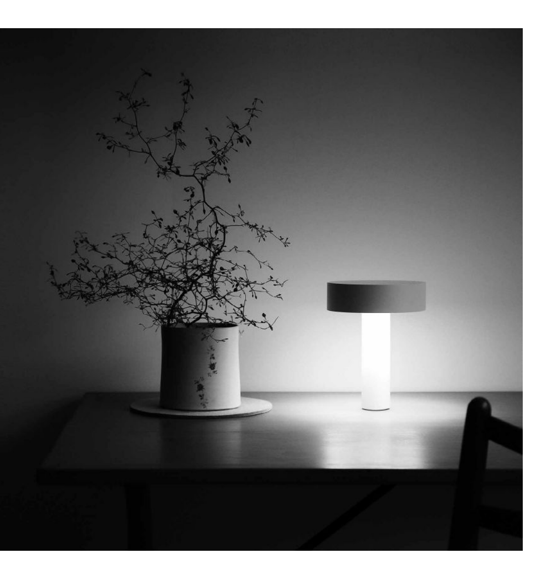
TABLE LAMP AND ACOUSTIC DIFFUSER - METAL - METHACRYLATE