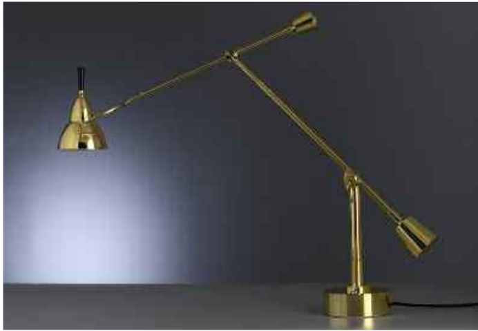
EB 27 Gold